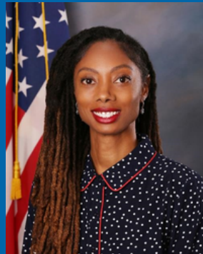
Princess Washington Councilmember