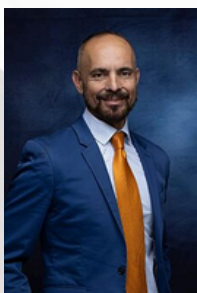
Christopher Cabaldon State Senator, SD3