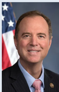
Adam Schiff U.S. Senator