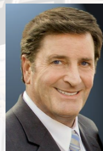
John Garamendi Congressmember, CD8