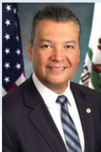
Alex Padilla U.S. Senator